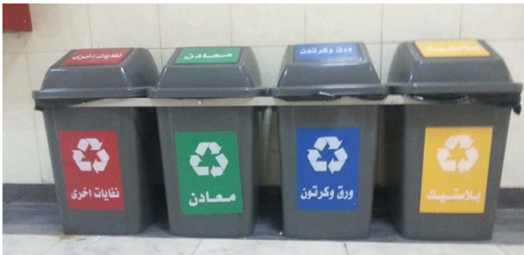
Figure (3): Different trash bins used to collect waste during the study

For 10 working days, the waste in the different bins is collected around the end of the students' school day (around 3:00 pm), where the total weight of each type is recorded. The recyclable materials (plastic, paper and metal) are collected by a local vendor who takes them to recycling, while the other waste is moved to the University waste collection center, where the waste is collected by Greater Amman municipality.