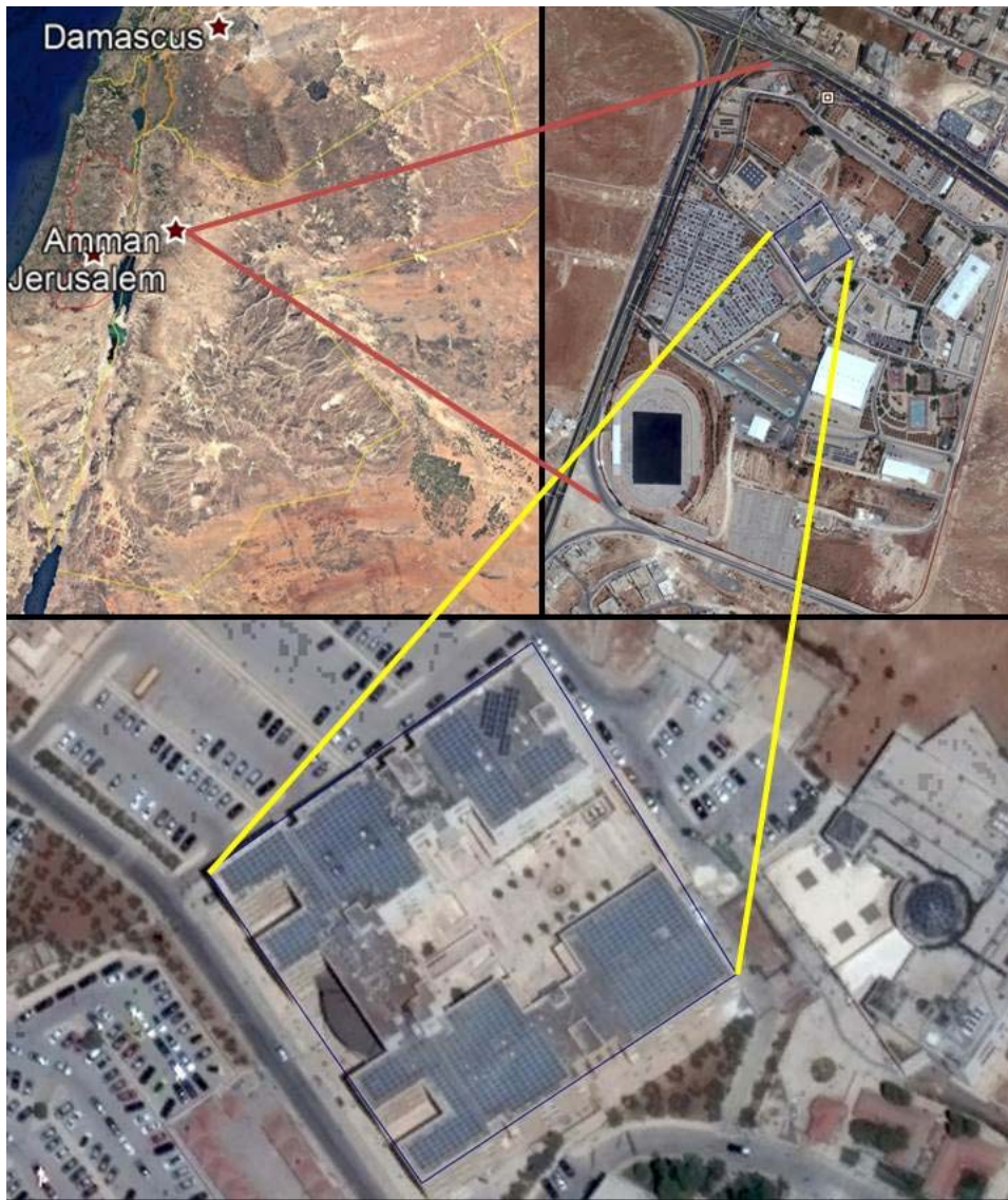
Figure (2): Location map of the study area