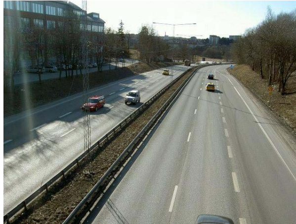
Figure 1: Test sections in fast lanes on E18 highway between the Järva-Krog and Bergshamra interchanges

reported average aggregate gradations for the mixtures. The base bitumen used was Pen 70/100. The polymer bitumen was designated Nypol 50/100-75 and rubber was GAP 16.