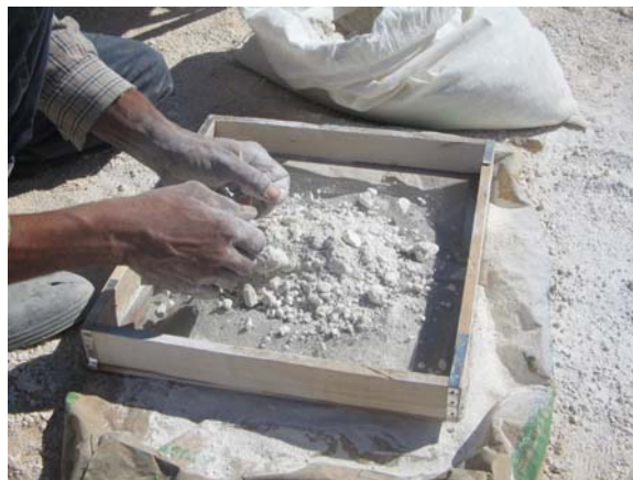
Figure (3): Marble sludge powder sieving.