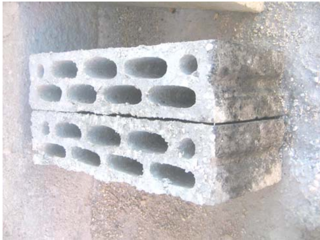
Figure (1): Produced 15 cm building blocks.

This work is actually directed to the field of designing new wall building blocks (Figure 1), dimensional compositions (Figure 2) which can meet Jordanian market requirements as well as global sustainable environment and everlasting the natural resources all over the world. Among the wide commercial and traditional concretes, building blocks must satisfy the highest and most strict quality standards, which apparently depend on the high quality of the raw materials and the optimization of the processing parameters.