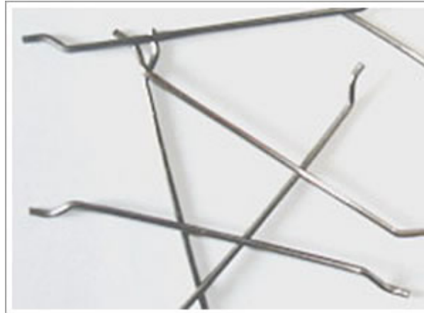
Figure 1: Steel fibers

necessary for fixing the specimen in the testing machine and for measuring strain. The remaining 150 mm bar length was covered inside the specimen. The modulus of elasticity of the high tensile strength steel bar was 206 GPa and its proof strength was 358 MPa. Table 1 lists the specifics of each test specimen.