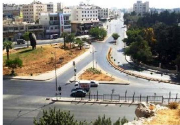
Figure 2: Examples of Hazardous Locations at Al-Madina Al-Monawarah Street

It is worth mentioning here that the definition of hazardous locations is different from a country to another and depends on the number of fatalities or injuries threshold values as well as other geometrical and traffic condition factors.